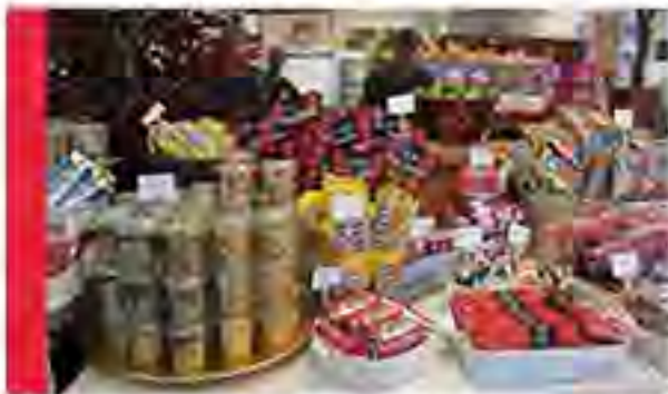
Richard Stockton Travel Plaza, New Jersey, USA Foodservice and Retail Merchandising Concept