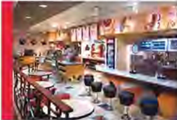
Eat'n Park Restaurant, Pittsburgh, USA Interior Design and Merchandising

We offer unique and personalized services that are thoroughly researched and customized to meet your particular needs, objectives and budget in a relatively short period of time. Diane will personally handle your project to make sure everything is on track until you are completely satisfied. Client satisfaction is one of Diane's top priorities and the commitment of each member of her team.